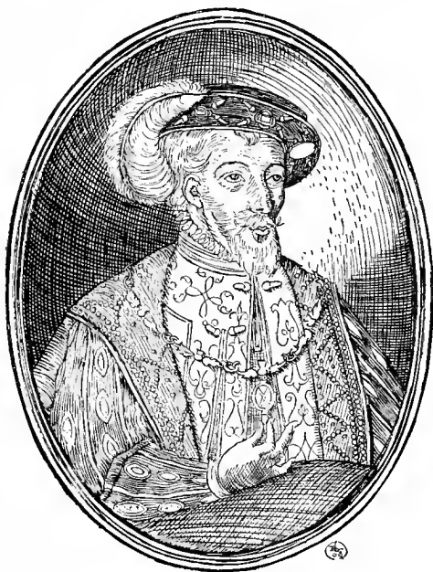
-IACOBVS.V, REX ,SCOTORVM.